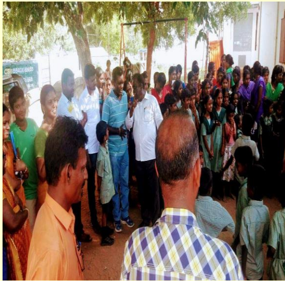
Distribution of Prizes to the School Students by the Faculty Members