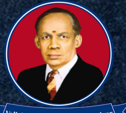
Vallal Dr. RM. Alagappa Chettiyar