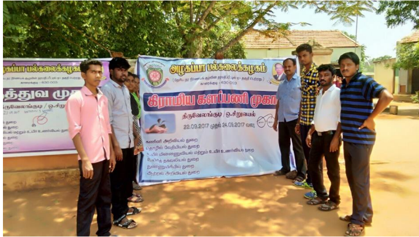
Field Visit – CIPET Madurai